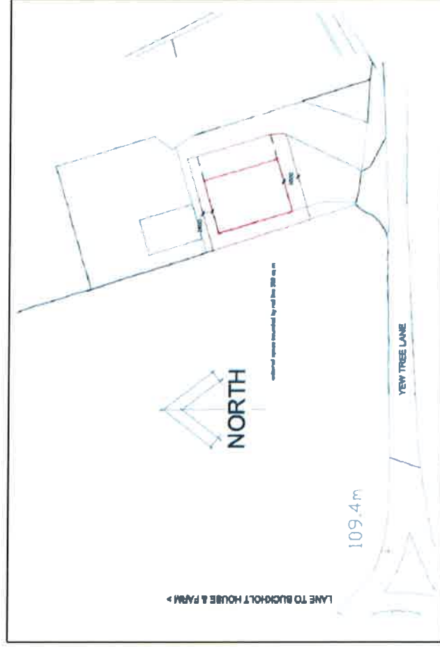
Site Plan - Not to Scale